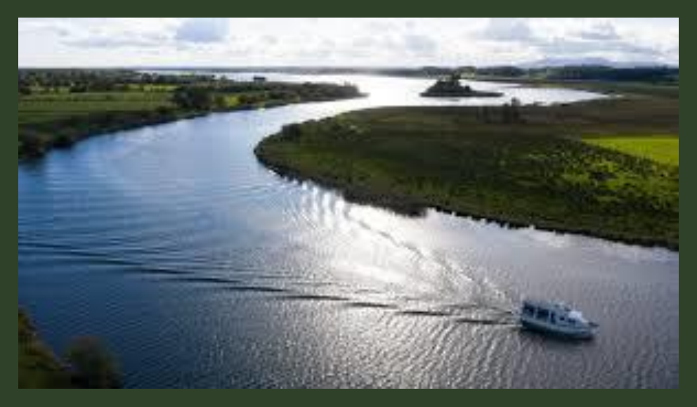
River Bann Boat Tours, Portglenone, Co. Antrim