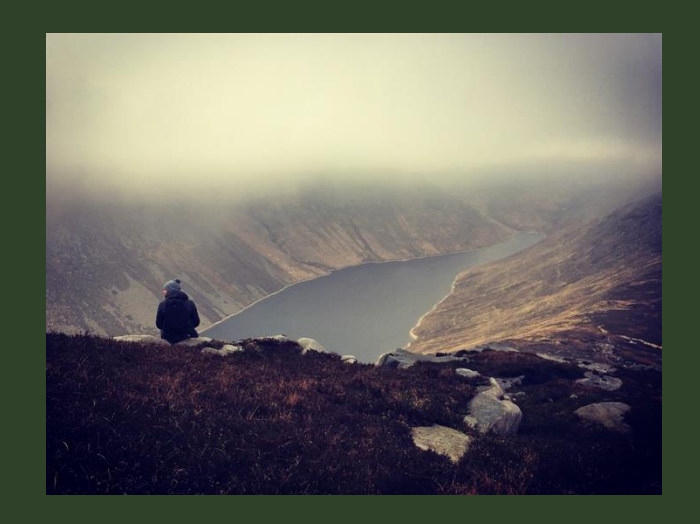
Slieve Binnian – 7 miles, circular