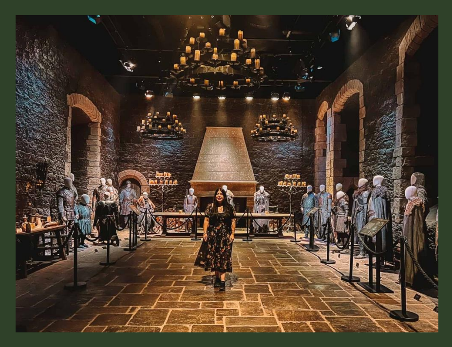
Game of Thrones studio tour