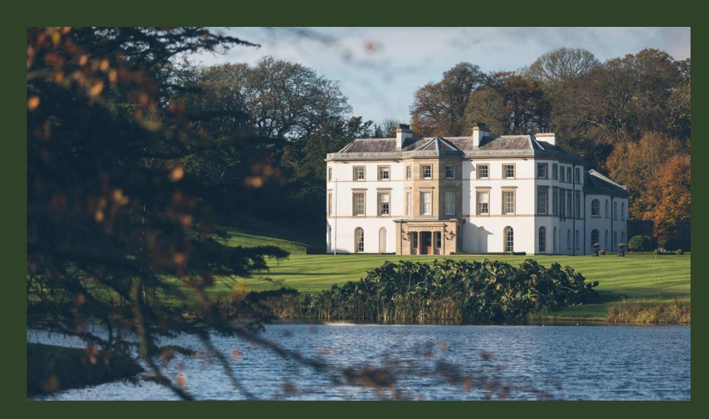
Montalto gardens & visitor centre, Co. Down