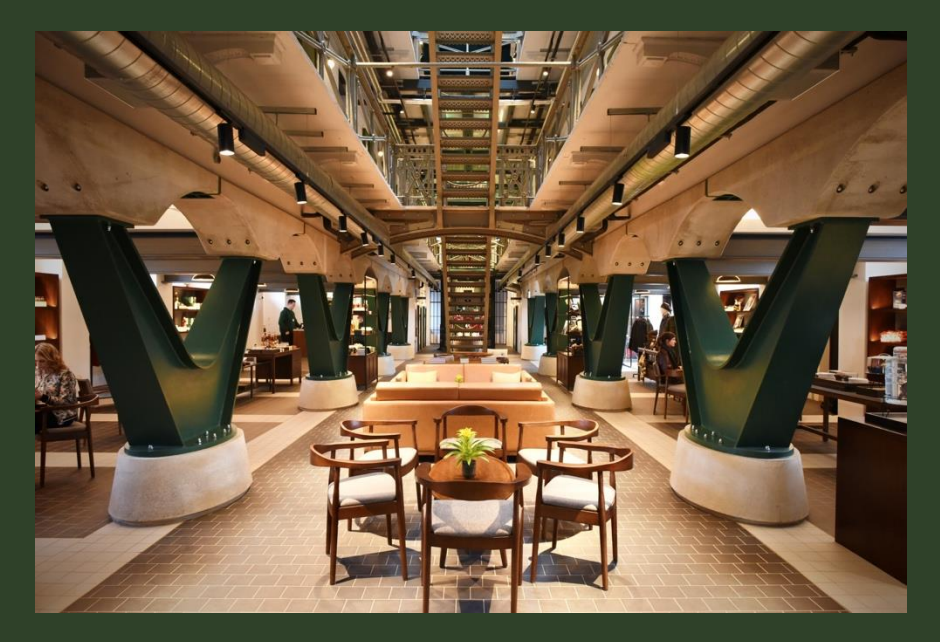
Crumlin Road Gaol & McConnell's Distillery, Belfast