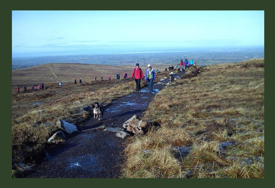
Black Mountain, Belfast