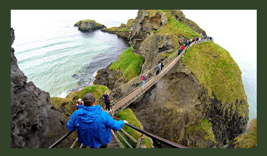
Carrick-a-rede rope bridge, North Coast