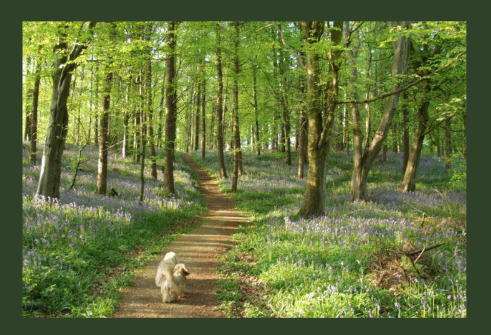
Portglenone Forest, Co. Antrim