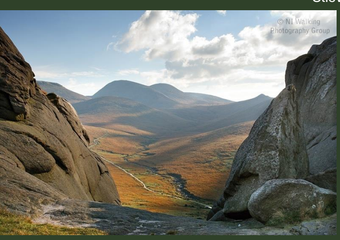
Hen, Cock & Pigeon Rock