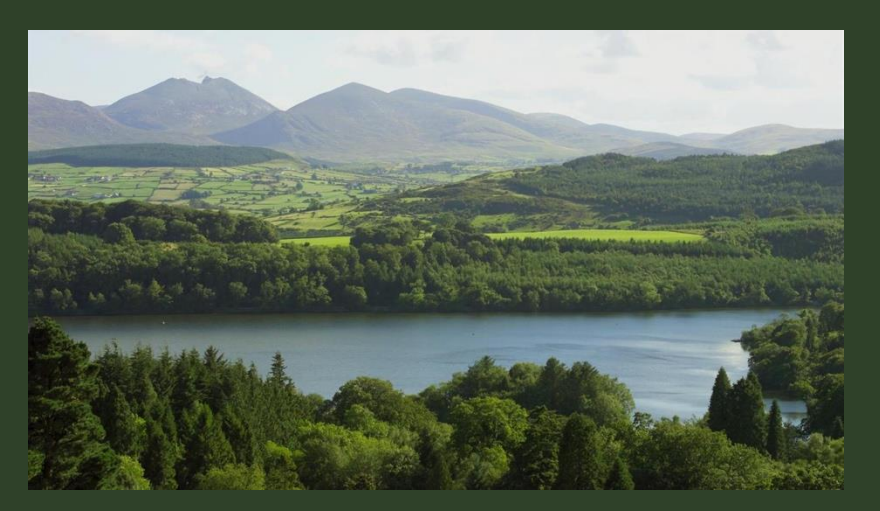
Castlewellan Forest Park, Co. Down