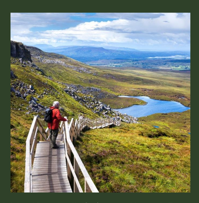
Church Island Boardwalk (Stairway to Heaven), Fermanagh