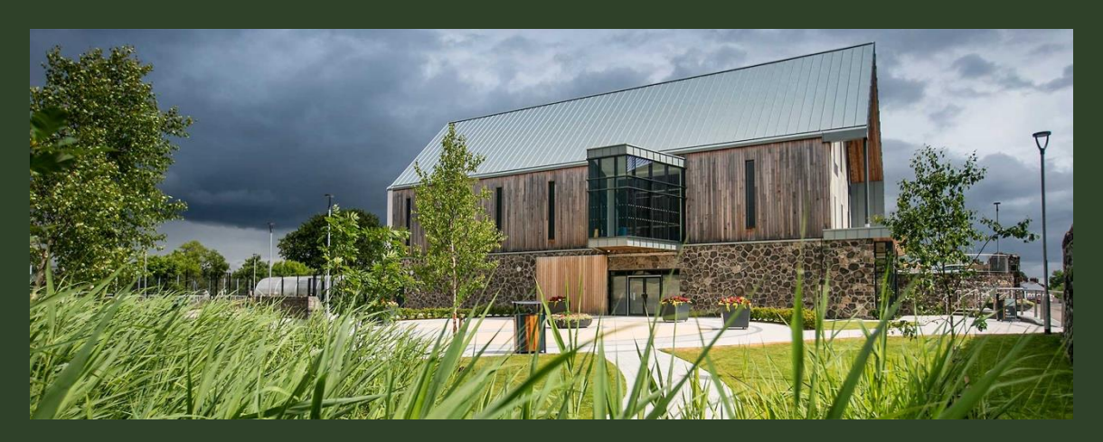
Seamus Heaney Homeplace, Bellaghy, Co. Derry