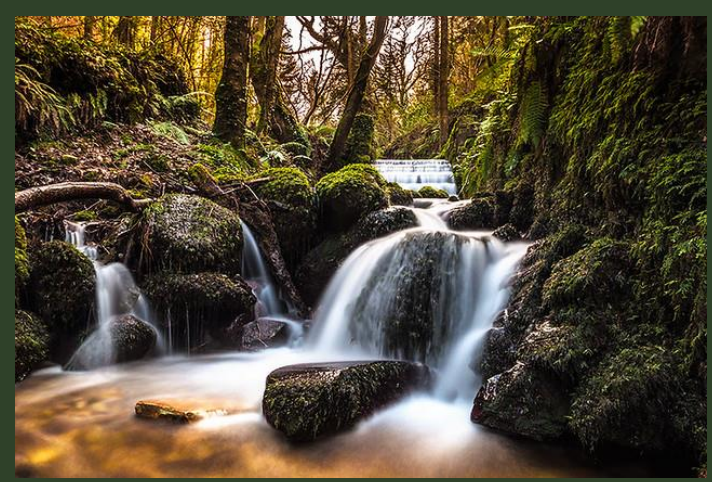
Kilbroney Forest Park, Warrenpoint