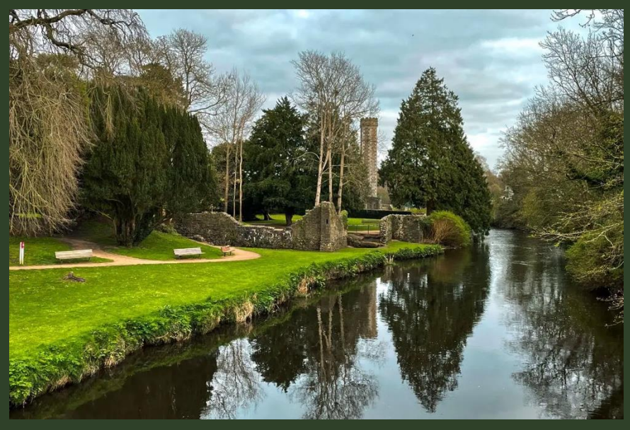
Antrim Castle Gardens