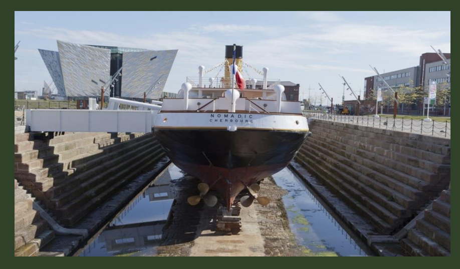
Titanic Quarter, Belfast