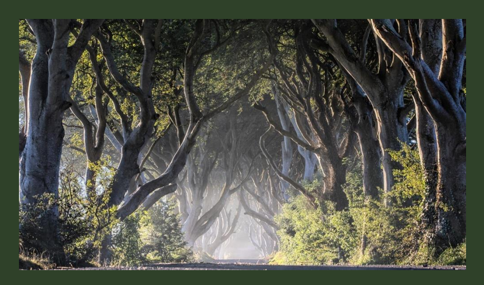
The Dark Hedges