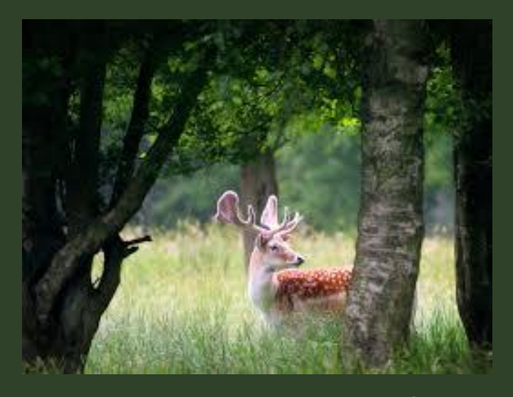
Randalstown Forest and the World of Owls