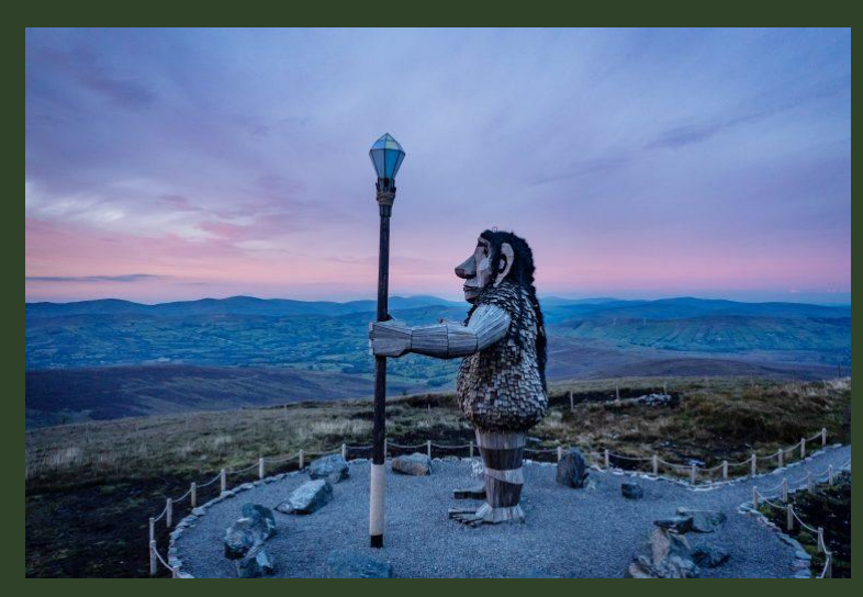
The Sperrin sculpture trail, Omagh Co. Tyrone