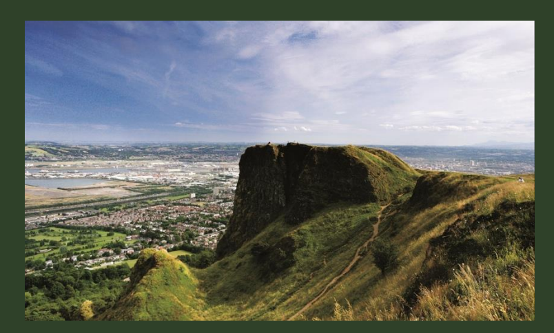
Cavehill Country Park, Belfast