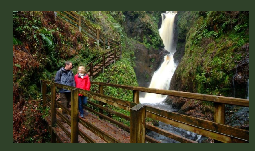
Glenariff Forest Park