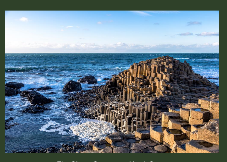
The Giants Causeway, North Coast