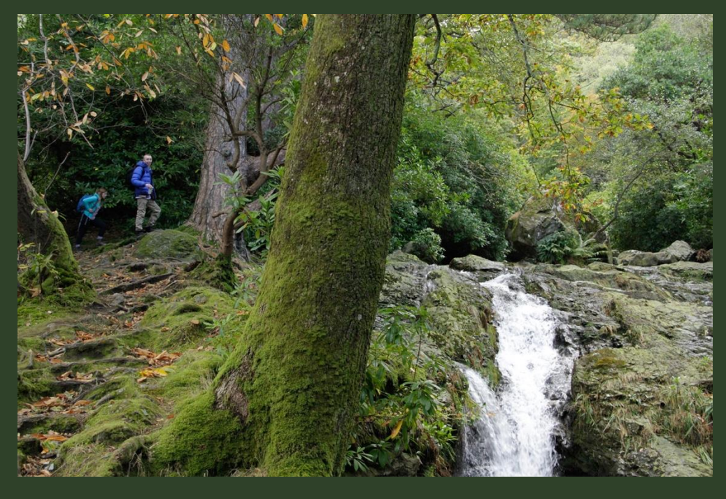
Slieve Donard (via Glen River) – 2.9 miles, linear