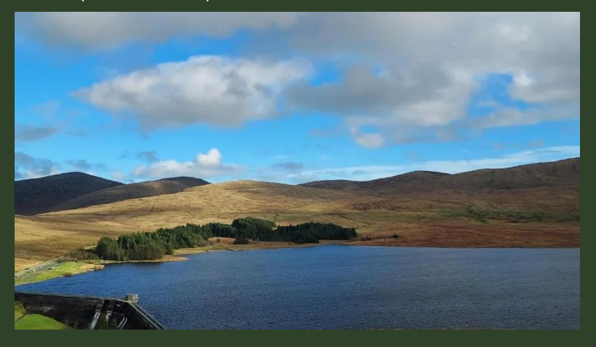
Spelga Dam & The Silent Valley