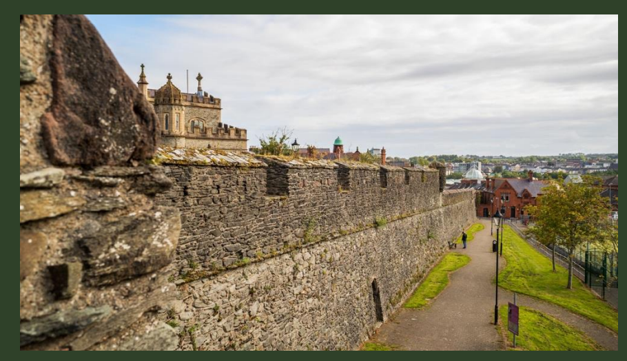
The Walled City, Derry